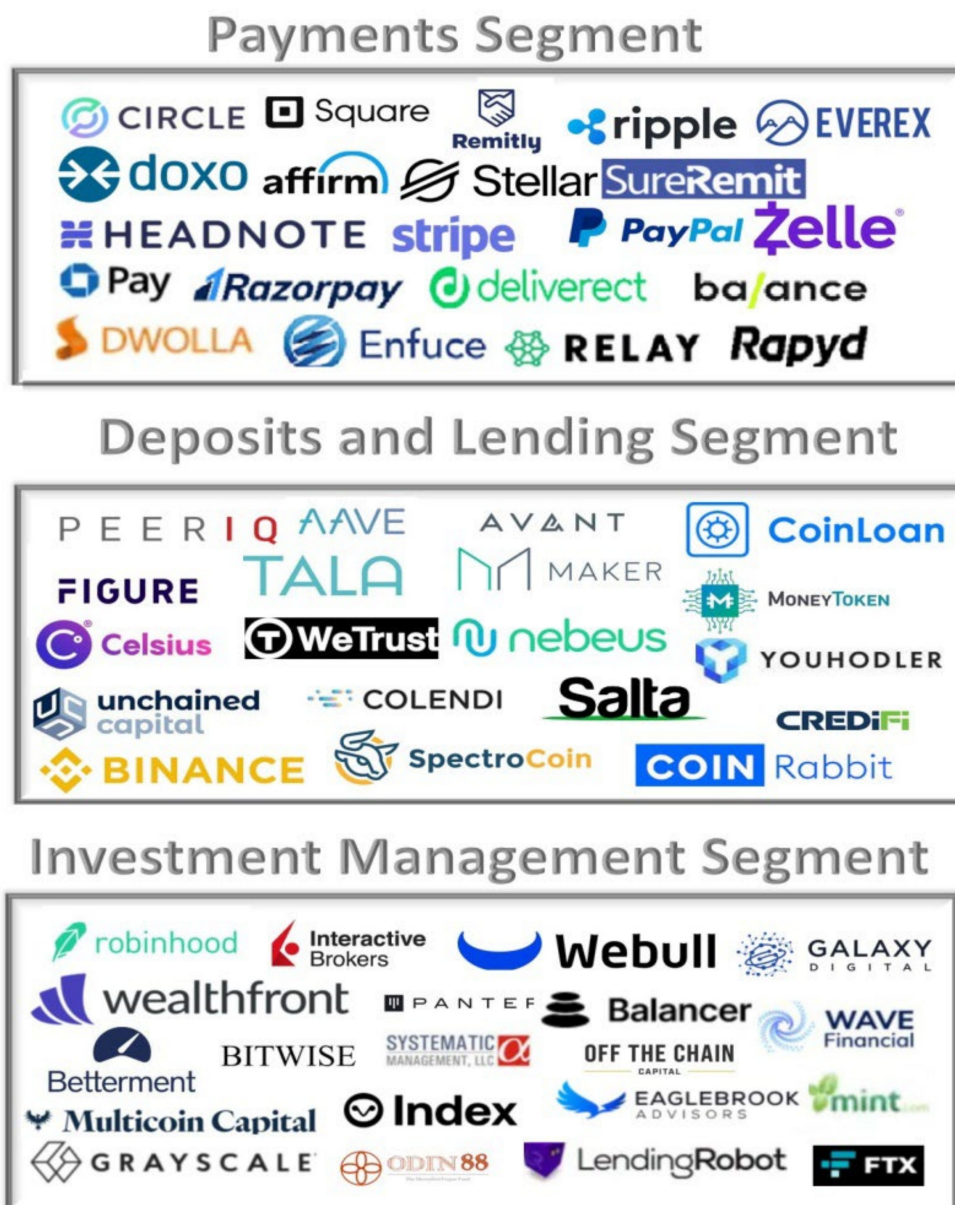
Figure 2. FinTech companies and segments.

For blockchain-based FinTech, it is crucial to understand what exact services a company is attempting to provide in order to understand the core components of these services. By understanding these components, one can formulate a plan to understand the requirements for the technology within this space.